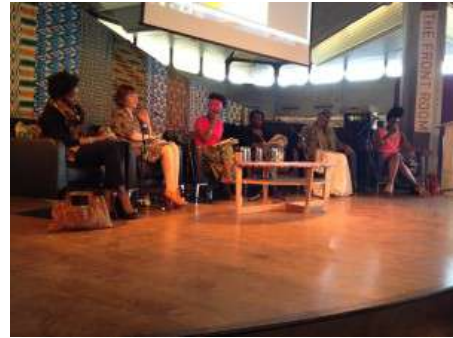
The panel for 'Not Just Zebra Print' thrashes out some issues

impressive range of key individuals from various fields of interest including human rights, the arts, research, social policy and the media being brought together for this event. The events include artistic performances, exhibitions and debates and we think it will appeal to a wide audience with interests in aspects of contemporary African culture that challenge the long-held negative perception of Africa as a lost cause. Where else would you hope to find under one roof, renowned singers and human rights activists, key media players, artists, designers – all on a mission to celebrate, enlighten, inspire and inform about Africa?