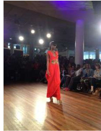
An elegant Bestow Elan gown on a model whose legs appeared to go on forever.

Established label Bestow Elan presented their current collection of sexy and sophisticated feminine pieces with signature features that identify and distinguish the innovative label.